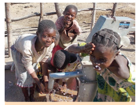
Together, we're saving sight and lives by providing clean water and eye health education to communities in Zambia!

Last year, a valued donor and friend to Operation Eyesight initiated a "Washing Away Blindness" campaign to bring fresh, clean water to