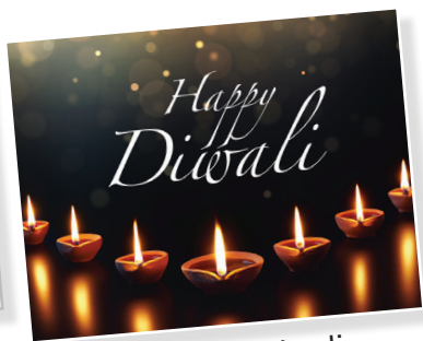
3 Happy Diwali