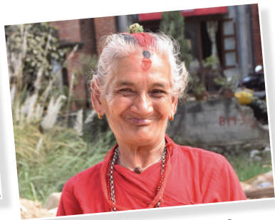
5 Smiling woman