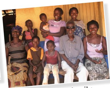
6 Kenyan family