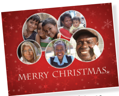
1 Merry Christmas

Note: Cards may not be exactly as shown.