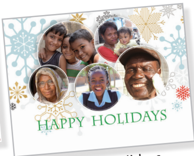
2 Happy Holidays