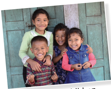
4 Nepalese children