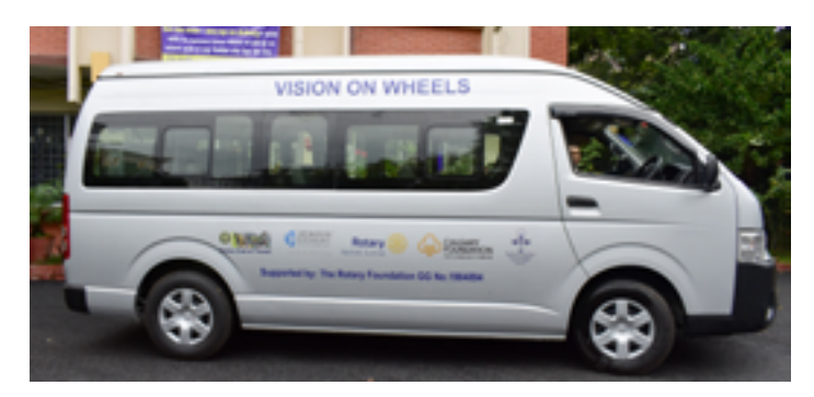
Coined "Vision on Wheels," this vehicle will bring quality eye care to remote areas in the Kathmandu Valley.

to on World Sight Day. There is #HopeInSight in ending avoidable blindness!