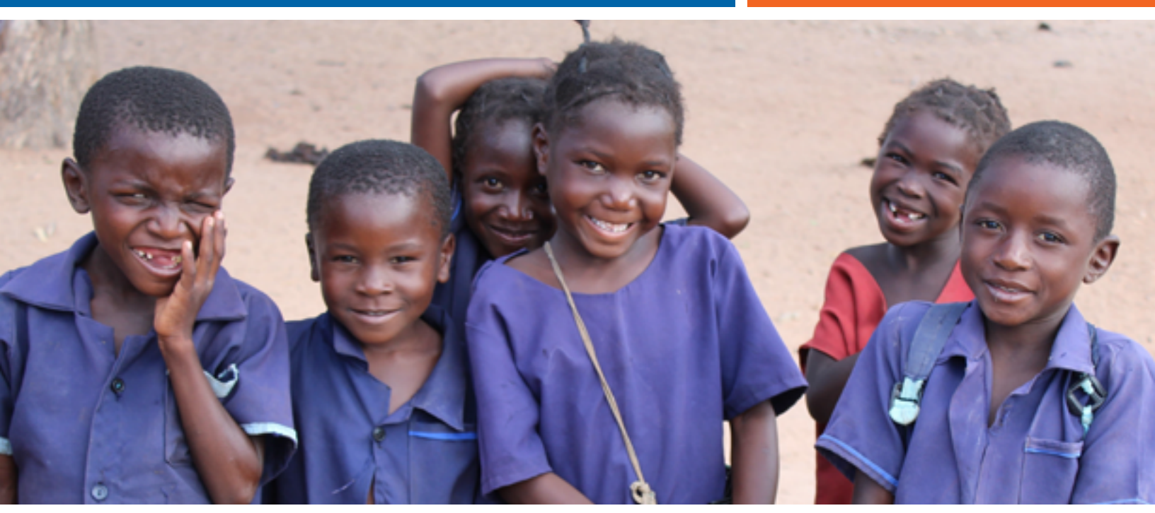
Big smiles for fresh water and healthy eyes. Through the generosity of our donors and through local partnerships, we're providing communities with access to clean water — preventing the spread of blinding trachoma and bringing a host of other benefits.