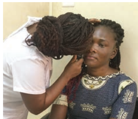
An ophthalmic nurse examines a patient's eyes at Tarkwa Municipal Hospital in Ghana. By educating staff members at partner hospitals on all aspects of eye health care, we help instill appreciation of the importance of the eye care programs they're helping to implement. This builds the staff's pride and ownership in their work!

This approach has served us well in reducing costs and improving patient services, while ensuring the continuity of the project. Our sustainable practices ensure our programs – and the community