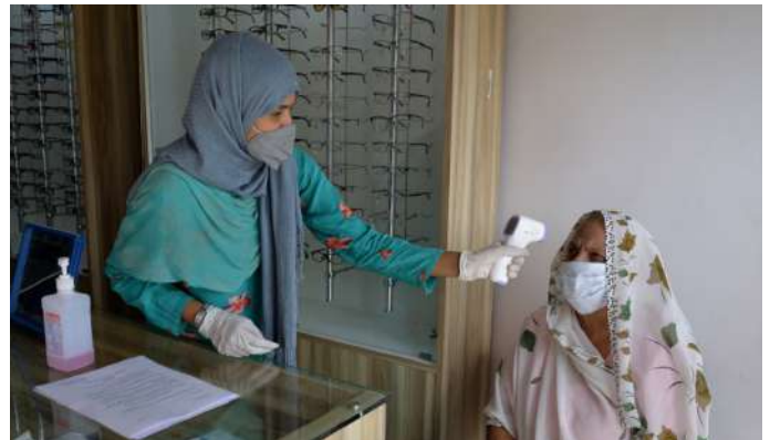
A woman has her temperature checked at a vision centre

In 2021, we continue to support our partner hospitals in the face of the pandemic so that together we can save sight and save lives. Right now, we're focusing our COVID-19 response efforts in India, Nepal and Bangladesh, where our partner hospitals urgently need PPE and life-saving supplies. We also continue to educate communities about COVID-19 prevention. To learn how you can help, visit operationeyesight.com/covid-19 .