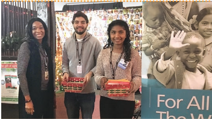
Warmest thanks to our terrific volunteers for your hard work at Christmas — and every day! We couldn't do it without you!